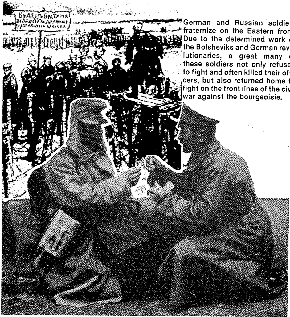
German and Russian soldiers fraternize on the Eastern front. Due to the determined work of the Bolsheviks and German revolutionaries, a great many of these soldiers not only refused to fight and often killed their officers, but also returned home to fight on the front lines of the civil war against the bourgeoisie.

"The social revolution can come about only in the form of an epoch in which are combined civil war by the proletariat against the bourgeoisie in the advanced