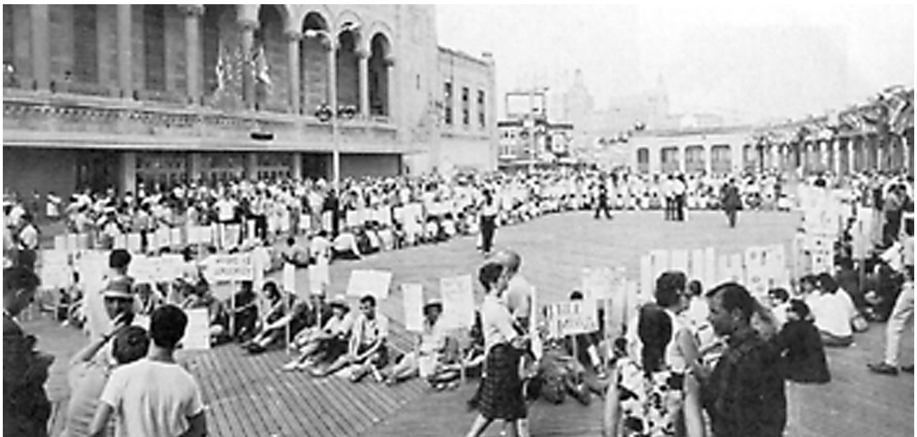
Atlantic City boardwalk, August 1964. Vigil in support of the MFDP challenge to the Democratic Convention.

Multiply these incidents — and much worse — a hundred times, and you get a sense of what was go-