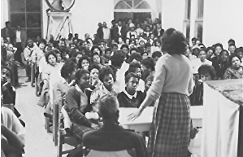
Mass community meeting to discuss voter registration and the MFDP in Benton County, MS. 1964.

The afternoon turned into evening and still no word. We went out for a bite to eat. No one wanted to voice our fears. As the evening grew late two cars and a pickup truck, driven by white men, circled our block several times. It was a threat, and we telephoned in their descriptions and license numbers. Some of us spent that night at the center, sleeping on the floor.