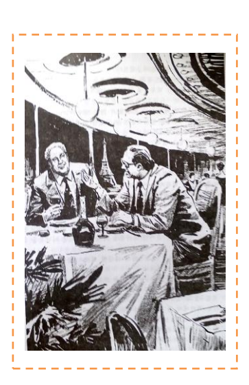
Where Has An Elegant Man Gone?