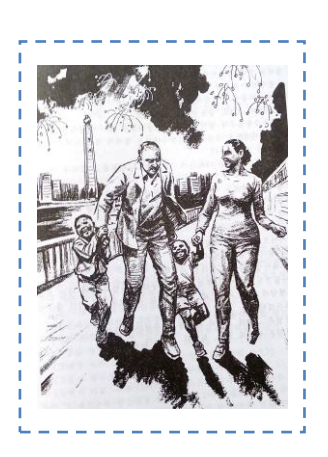
To Whom Was A Beauty Girl Married?