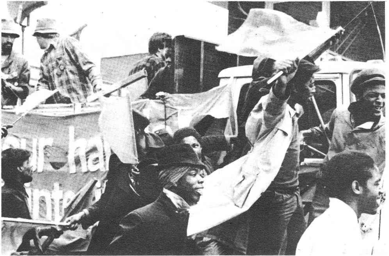
May Day 1980

ble. That seed, the Revolutionary Union (RU), played the key role in the founding of the RCP in 1975. It grew up in and was part of that ‘60s tradition’ here and internationally of making radical breaks with tradition, including the heavy weight among the ‘American left’ of respectable and patient so-called ‘politics.’”