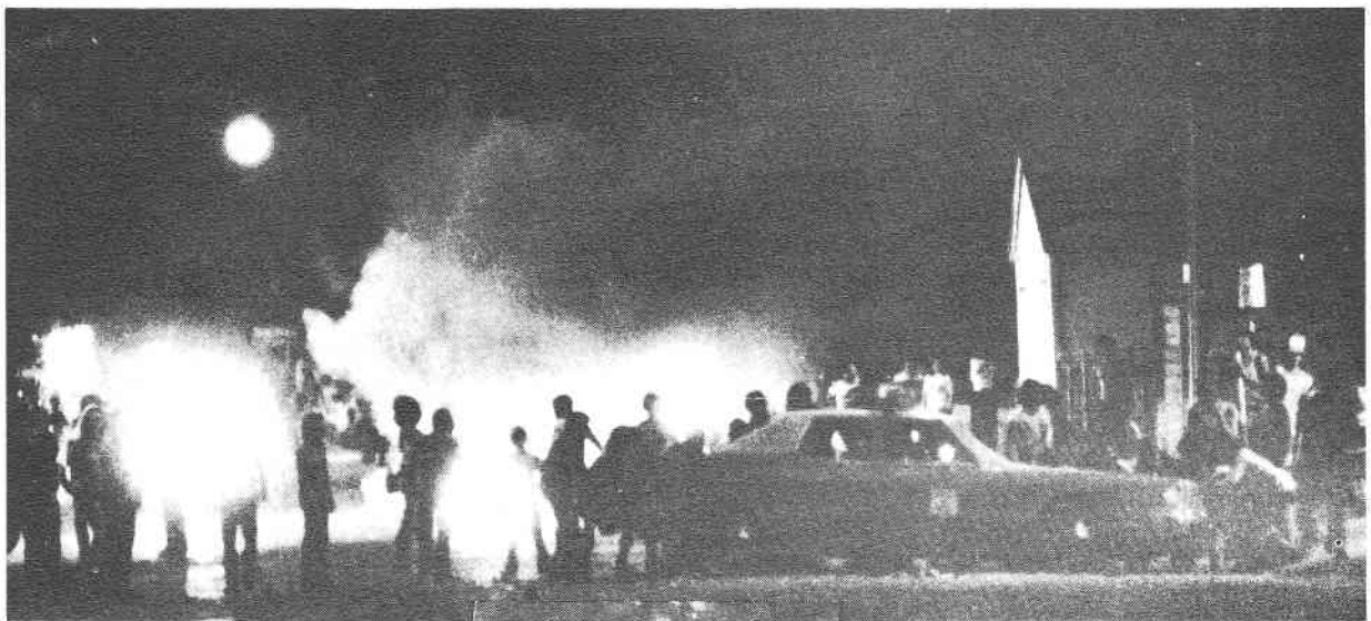
1978. Moody Park, Houston, Texas. Angered by court fine of $1 as "punishment" in the police murder of a Mexican-American youth, the barrio explodes.