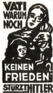
Leaflet of the KPD's Saeftkow organization (Berlin, 1944).