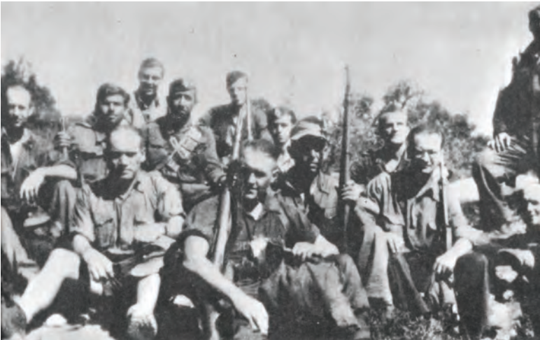
German and Greek partisans of the National Liberation Army of Greece, August 1944.