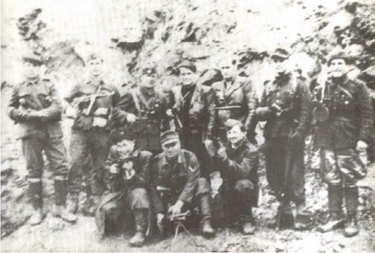
German and Slovak partisans during the great Slovak antifascist uprising of 1944.