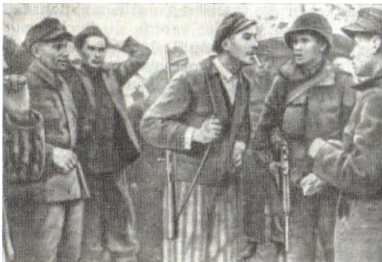
The Buchenwald insurgents (with American soldiers and SS prisoners) after the camp's self-liberation.