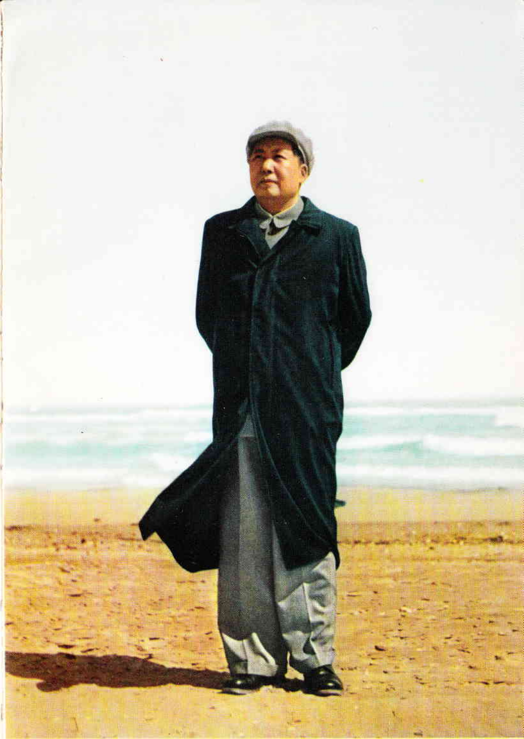
Our great leader Chairman Mao Tse-tung