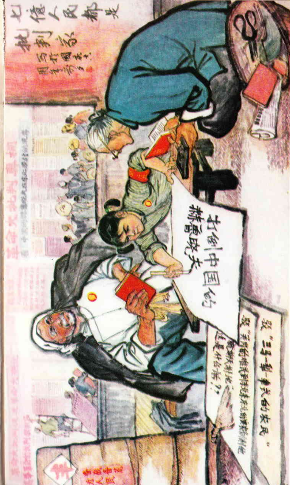
Seven Hundred Million People Are Critics (traditional painting) ▶

The sky is a vast expanse of blue, flecked with white clouds, above the magnificent far-stretching countryside. The sky rings with songs about mobile warfare.