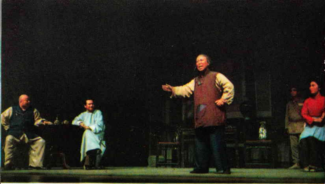
◀ Aunt Sha denounces the enemy Kuo Chien-kuang leads the vanguard in a surprise attack on Shachiapang ▼