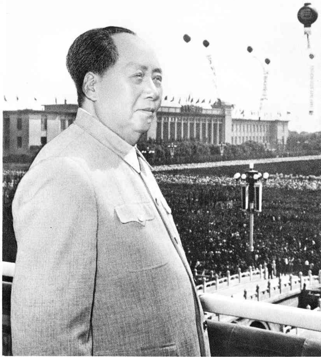
Our great teacher, great leader, great supreme commander and great helmsman Chairman Mao Tse-tung