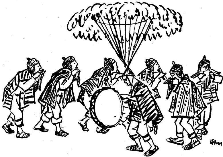
The "Cebollita" instrumentalists