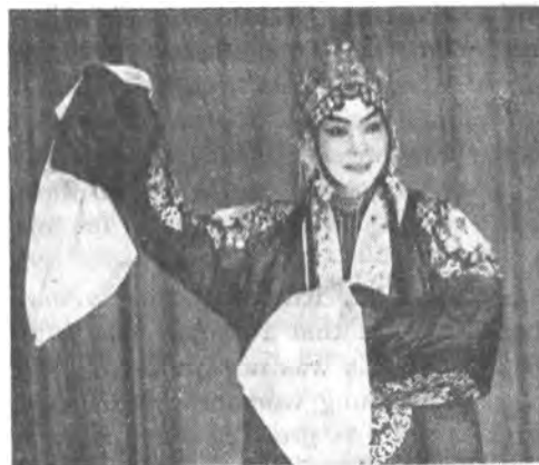
Mei Lan-fang in his new opera Mu Kuei-ying Takes Command .

There are different types in other roles, too, such as old or young men, various kinds of clowns, villains, rough fellows and so on, all of whom have their distinctive modes of expression. This is true of Peking opera as well as of the other local operas. Past exponents of opera drew on their experience of life to invent appropriate gestures and expressions