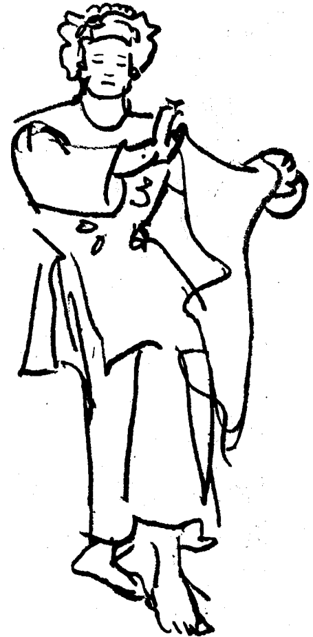
Gadis Tarana Sketch by Yeh Chien-yu