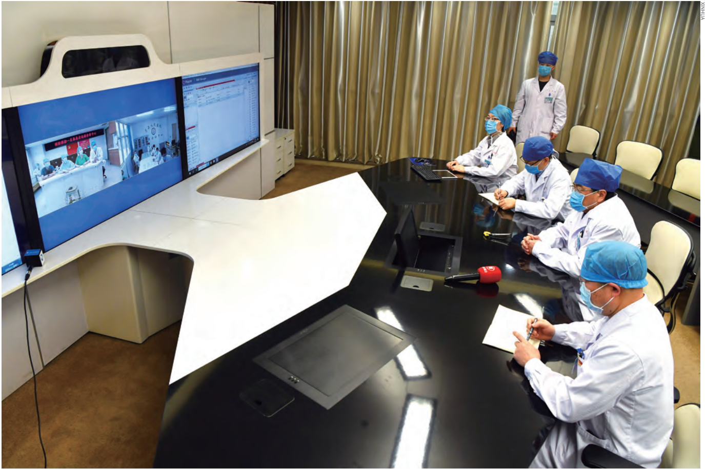
A group of medical experts provide remote consultation at a smart medical treatment center in Zhengzhou, Henan Province in central China, on February 1