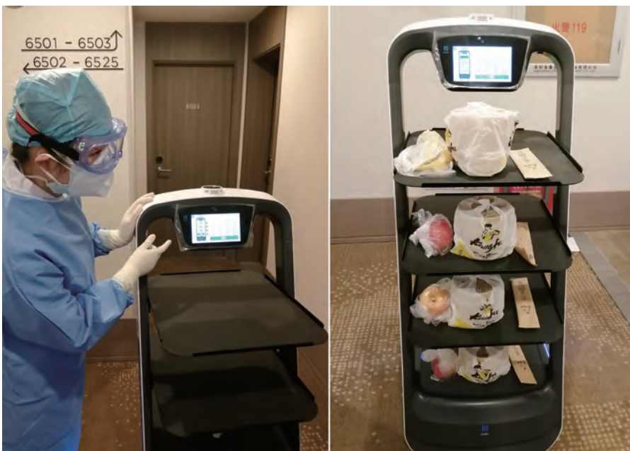
A medical worker introduces a food delivery robot in Shenzhen, Guangdong Province in south China on February 7. Hi-tech is being used in the city in the prevention and control of the novel coronavirus