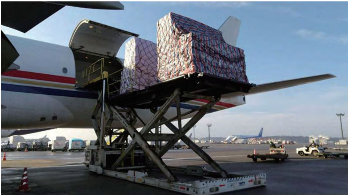
A cargo of donated masks is off-loaded at Narita International Airport in Tokyo, on March 3. Jack Ma, co-founder of Hangzhou-based e-commerce giant Alibaba, has donated 1 million facial masks to Japan in return for the generous help Japan gave China when the latter was hit severely by COVID-19. The Jack Ma Foundation and the Alibaba Foundation announced on March 2 that the masks will be donated to Japan to help alleviate suffering during the epidemic. "Like the mountain range that stretches before you and me, let's share the same trials and hardships together. We hope everything will get better soon," Ma said on his Weibo account, citing an old Chinese poem.