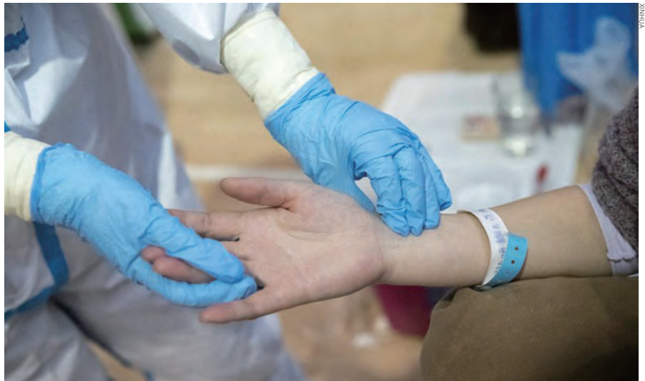
A medical worker examines a patient with traditional Chinese medicine (TCM) therapies at a temporary hospital in Jiangxia District in Wuhan, central China's Hubei Province, February 25

Medical staff from 20 TCM hospitals of five provinces took charge of the infected patients in the hospital with support from the district TCM hospital. It is Wuhan's first temporary hospital that followed the treatment and management mode of TCM hospitals in China. CI