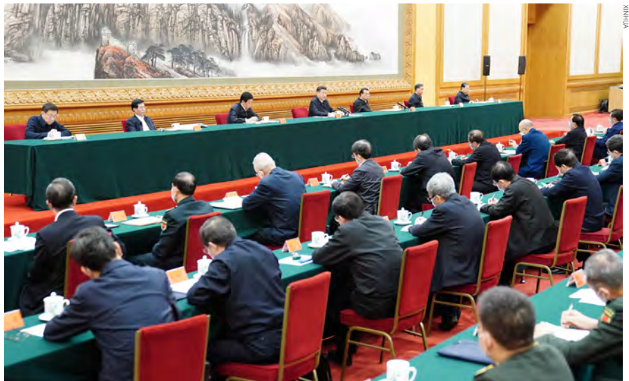
Party and state leaders Xi Jinping, Li Keqiang, Li Zhanshu, Wang Yang, Wang Huning, Zhao Leji and Han Zheng attend a meeting to advance the work on coordinating the prevention and control of the COVID-19 and economic and social development, in Beijing, on February 23

The country should resolutely accomplish the task of alleviating poverty despite the impact of the epidemic, Xi said, urging efforts to help poor workers return to their posts in an orderly manner, support leading poverty alleviation enterprises and workshops to resume work as soon as possible, and improve mechanisms to prevent people from returning to poverty.