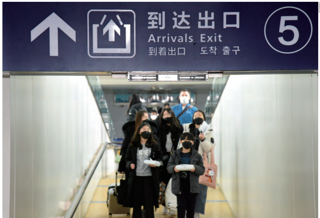
Passengers arrive at the Qingdao Liuting International Airport on February 25. The airport took initiative to communicate with foreign passengers to better ensure the epidemic control, and since February 24, it adopted stricter measures to manage people who entered China.

Zhao stressed that the epidemic control regulation in places like Beijing