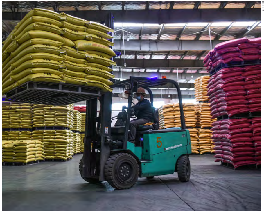
A worker loads livestock feed at an animal feed mill in Qinzhou, Guangxi Zhuang Autonomous Region in south China, on February 9

In 2003, China's economy declined in the second quarter due to the severe acute respiratory syndrome. But then it rebounded with an annual economic growth rate of 9.1 percent. Similarly, while the current outbreak will affect economic growth temporarily, once the epidemic is under control, the economy will return to stable growth, and the consumption and investment disturbed by the virus will rebound, leading to economic recovery. CI