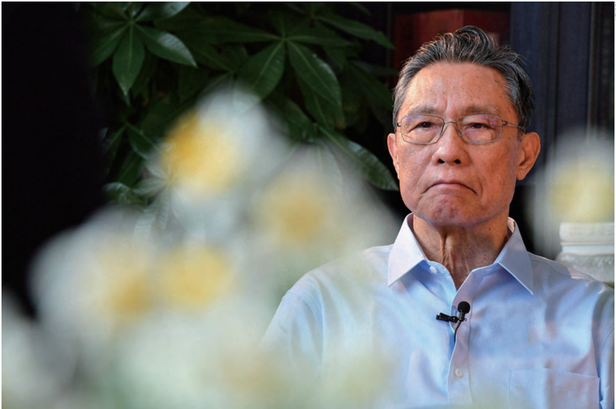
Zhong Nanshan in this file photo

Initially reported to have originated in the now-dismantled Huanan Seafood Wholesale Market in Wuhan, the epicenter in Hubei Province, central China, the source of the novel coronavirus (COVID-19) now remains unknown as new evidence challenges the original assumption.