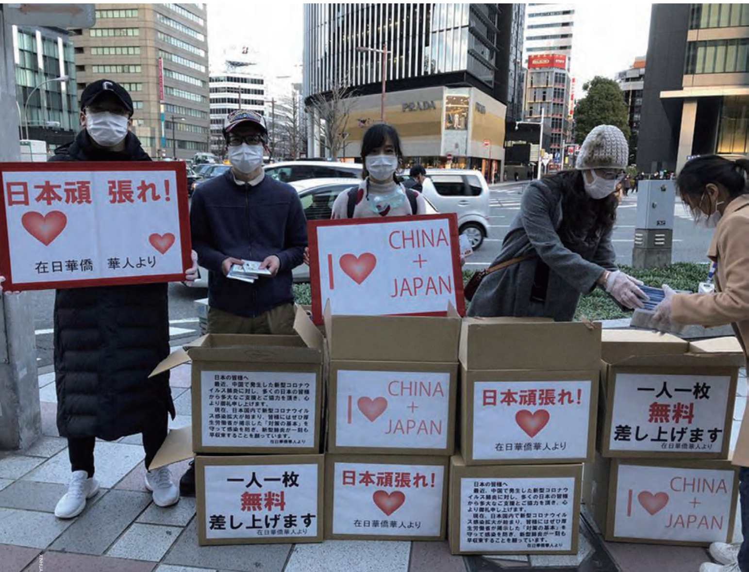
Members of a Chinese volunteer group distribute masks to local people in Nagoya, Japan, February 20. As COVID-19 continues to spread in Japan, many overseas Chinese there have voluntarily come out on the streets to distribute masks to the local people, expressing gratitude to the Japanese people for their selfless help to China during the virus outbreak.