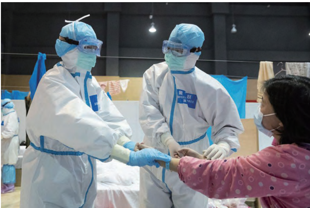
Medical workers examine a patient with TCM therapies at a temporary hospital in Jiangxia District in Wuhan