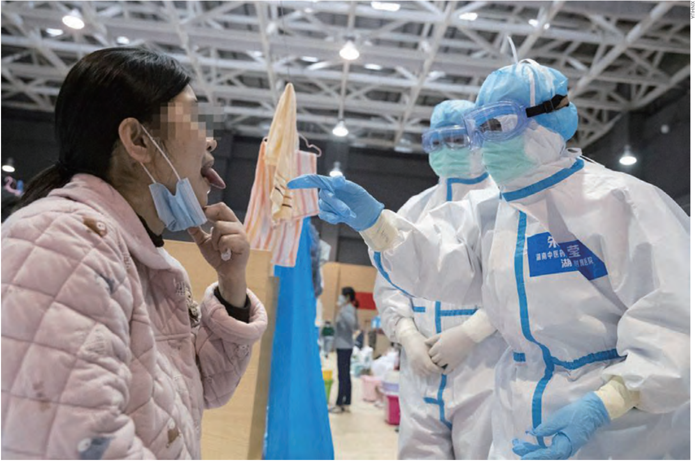
Medical workers treat a patient with TCM therapies at a temporary hospital in Jiangxia District in Wuhan, February 25