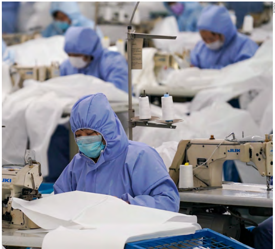
The Hodo Group's production line turns out protective suits in Wuxi, Jiangsu Province in east China, on February 8

China has its own advantages, which have laid a solid foundation for its economic growth despite criticism of the Chinese system by the U.S. media and certain politicians. This system has powered China to