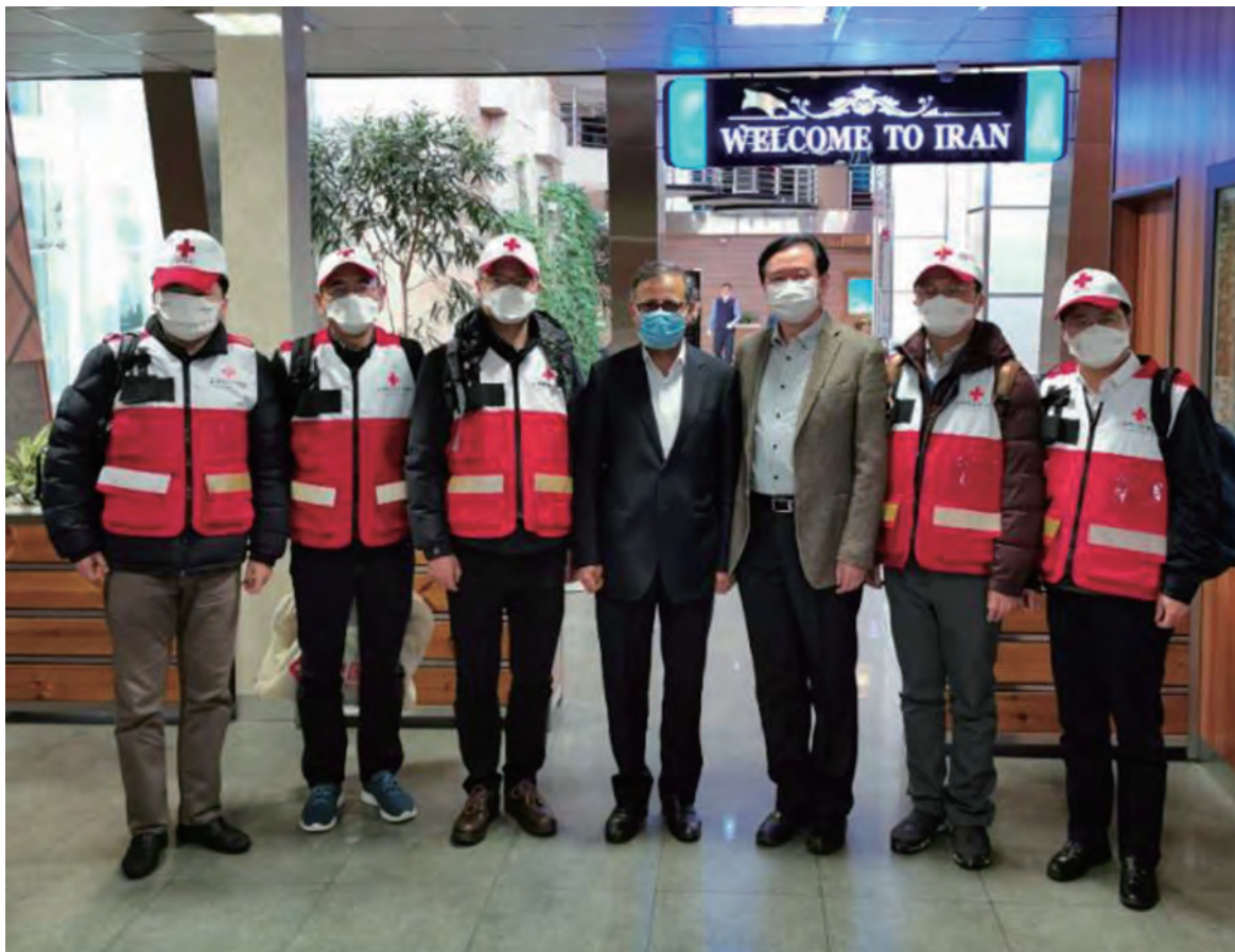
Chinese Ambassador to Israel Chang Hua (third from right) and an official from the Iranian Health Ministry welcome a volunteer team of the Red Cross Society of China in Teheran, Iran, on February 29. On February 28, State Councilor and Foreign Minister Wang Yi had a phone call with Iranian Foreign Minister Mohammad Javad Zarif. When the novel coronavirus disease (COVID-19) broke out in China, Iran was the first country to extend its sympathy. China will never forget it. Recently there have been more COVID-19 cases in Iran. China has made an emergency donation of nucleic acid detection kits and medical equipment to Iran. China will continue to help Iran within its capacity in line with the needs of the Iranian side, which will include cooperation in areas such as epidemic prevention and control and medical treatment, Wang said.

China in turn is offering help to countries suffering from the outbreak. To date, the country has provided test kits to Japan, Pakistan and the African Union, and shared its medical solutions and dispatched specialists to many countries. The Chinese Government, organizations, enterprises and individuals are ready to extend support to the world as a whole. CI