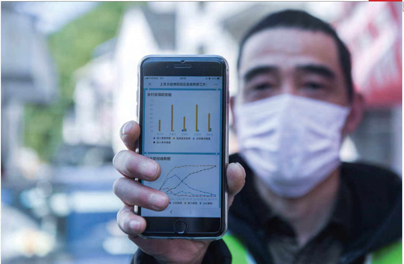
A staff member at a village checkpoint in Hangzhou, Zhejiang Province in east China, shows how to obtain instant data for epidemic prevention and control on February 20