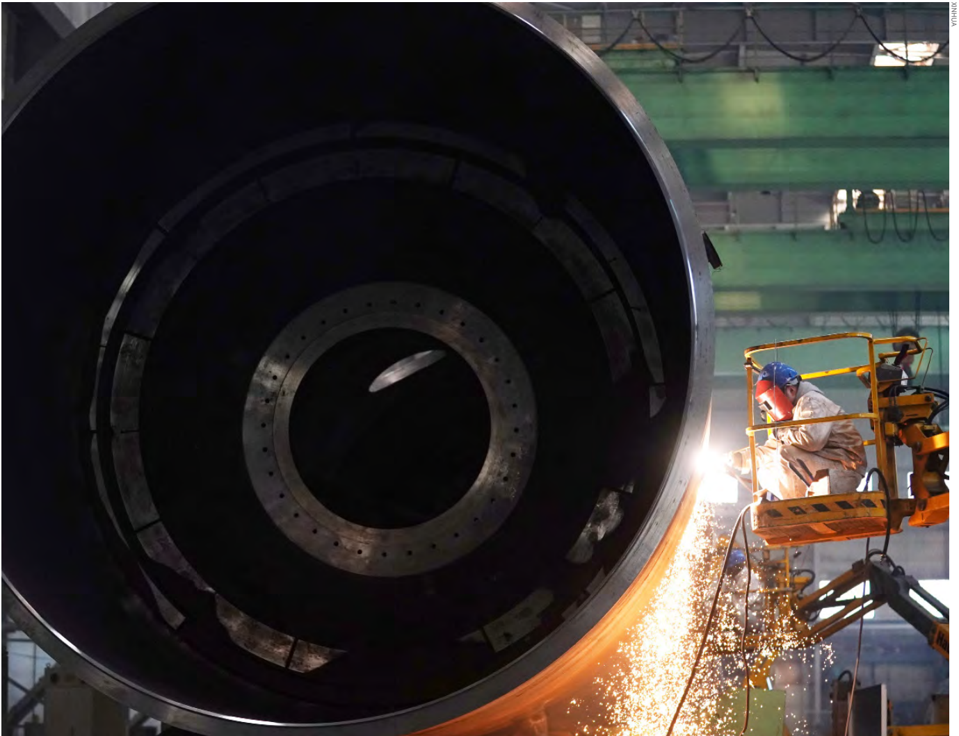
A welder works at Harbin Boiler Co. Ltd. in Harbin, Heilongjiang Province in northeast China, on February 10