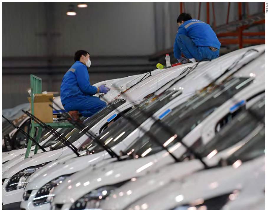
At the Jiangling Motors Group's production base in Nanchang, Jiangxi Province in east China, workers check ambulances on February 6