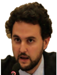
The author is director of EU-China Programs at the Center international de formation européenne

The Chinese leadership has not looked for excuses even though the international criticism against it has been often unfair. CI