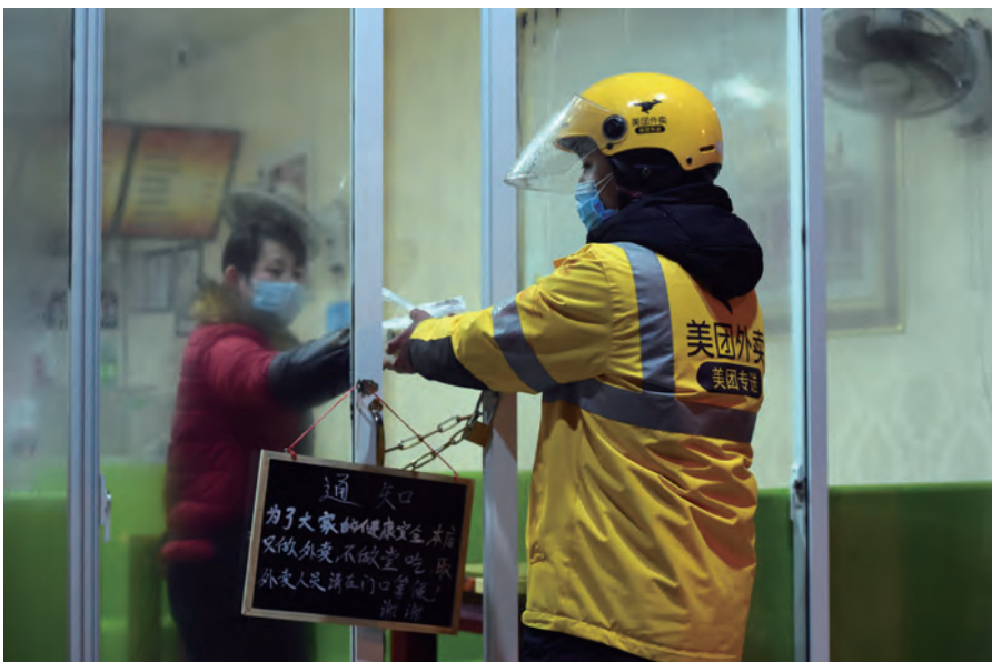
A food delivery man takes dishes from a restaurant in Hefei, Anhui Province in east China, on February 6

"With rising demand, remote work will expand to more industries, which can inject impetus into domestic enterprises and promote the digital transformation of the Chinese economy," Hu said. C