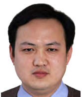
The author is a commentator of Beijing Review

In addition, China has a well-developed logistics industry and highway, railway and