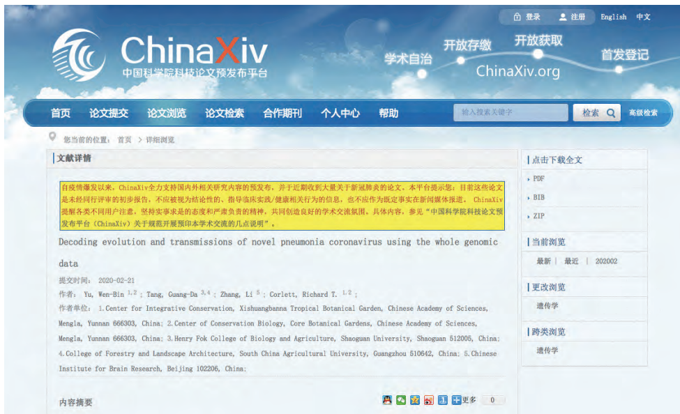
A screenshot of the paper published on ChinaXiv

Phyloepidemiologic analyses indicate the SARS-CoV-2 source at the Huanan market should be imported from other places