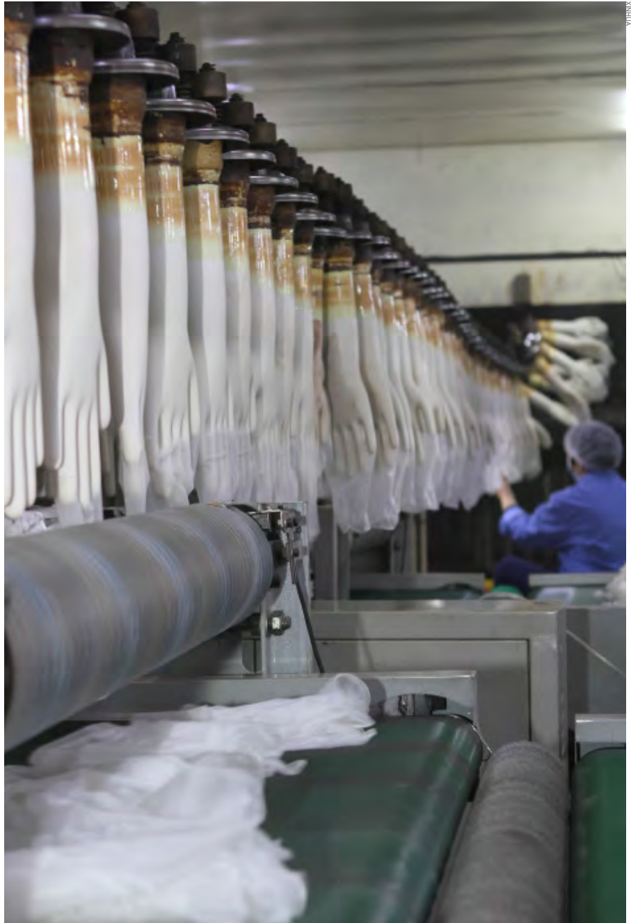
A worker hangs disposable gloves at a production plant in Shijiazhuang, Hebei Province in north China, on February 10