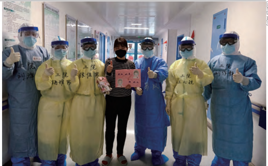
Doctors of Peking University Third Hospital, a renowned hospital in Beijing, say goodbye to a patient to be discharged from a ward in Wuhan on February 19