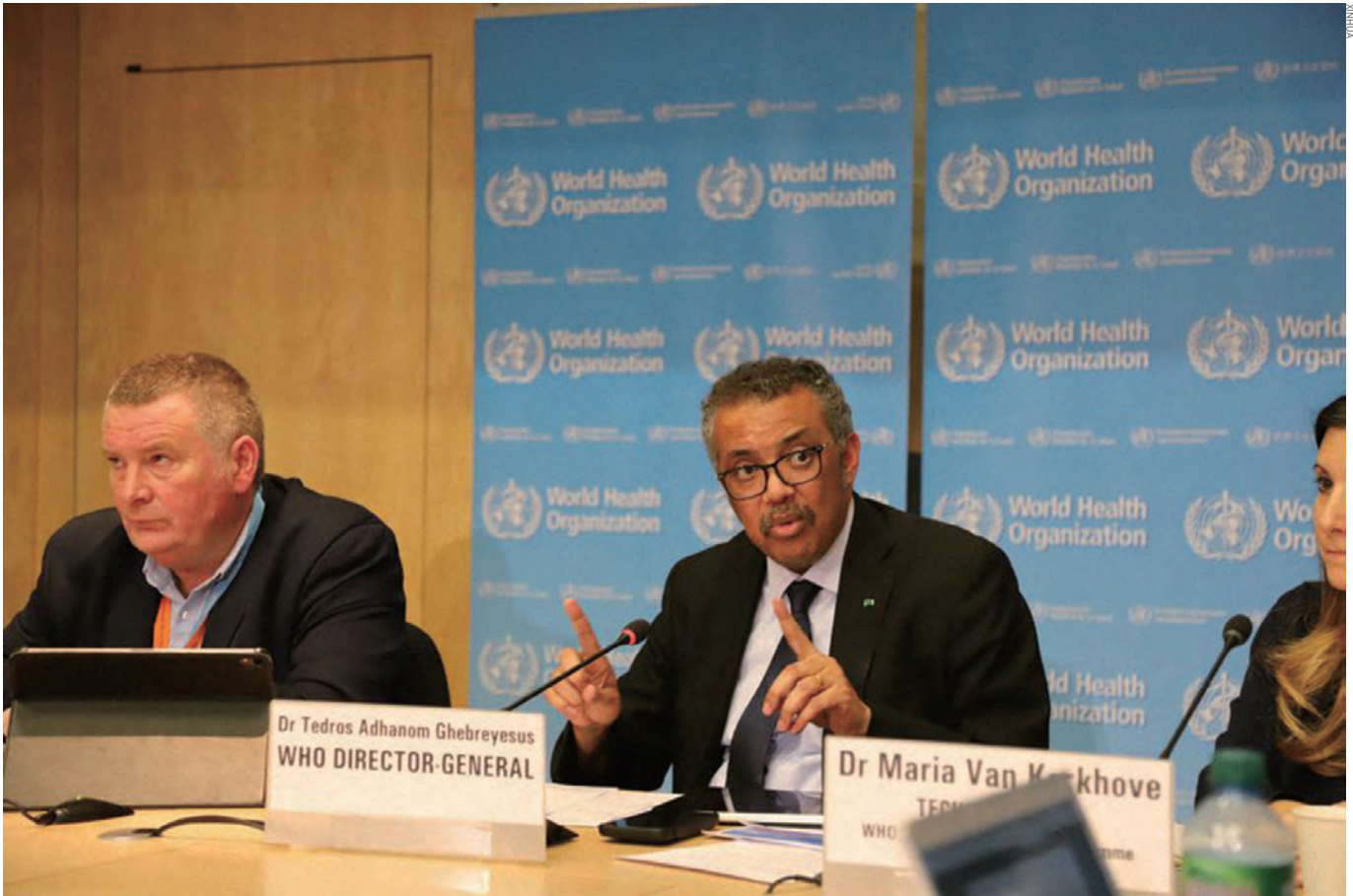
The World Health Organization (WHO) Director-General Tedros Adhanom Ghebreyesus (center) speaks at a daily briefing in Geneva, Switzerland, February 27