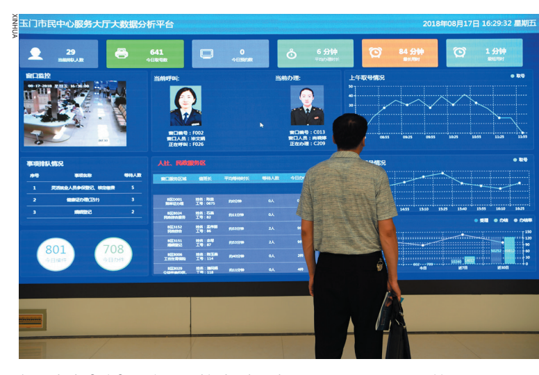
A man looks for information on a big data-based e-governance system at a citizen service center in Yumen, Gansu Province in northwest China, on August 18, 2018

Last year, Aliyun, a subsidiary of Alibaba focusing on cloud computing, won the bid for a city brain project in Hainan Province in south