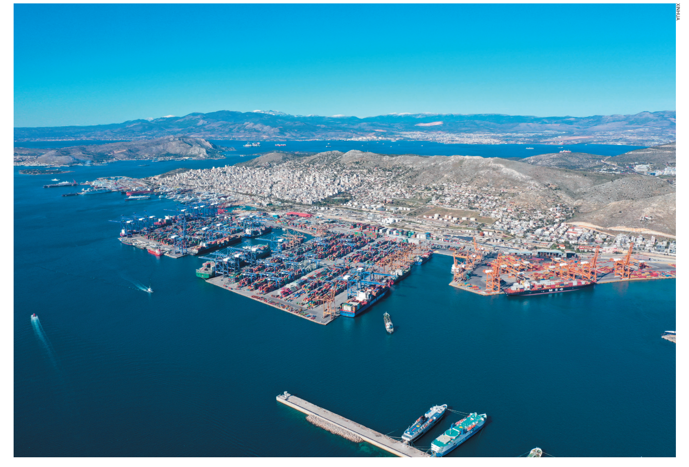
An aerial photo of the Greek Port of Piraeus taken on January 16. The port, operated by Chinese shipping company COSCO, is a flagship project under the Belt and Road Initiative