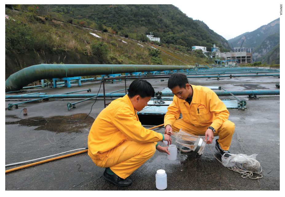
Staff members collect water samples at a pollution treatment facility along the Wujiang River in Guizhou Province, southwest China, on November 18

Tariffs will be further lowered in 2020. Stable growth of foreign trade will be ensured through exploring more export markets in