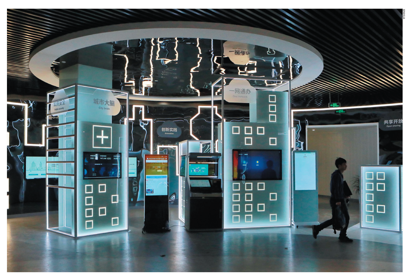
The demonstration center of the National Big Data Comprehensive Pilot Zone in Guizhou Province, southwest China, on May 22

The Hangzhou initiative illustrates how administrative reform and a new round of technological revolution are being integrated for