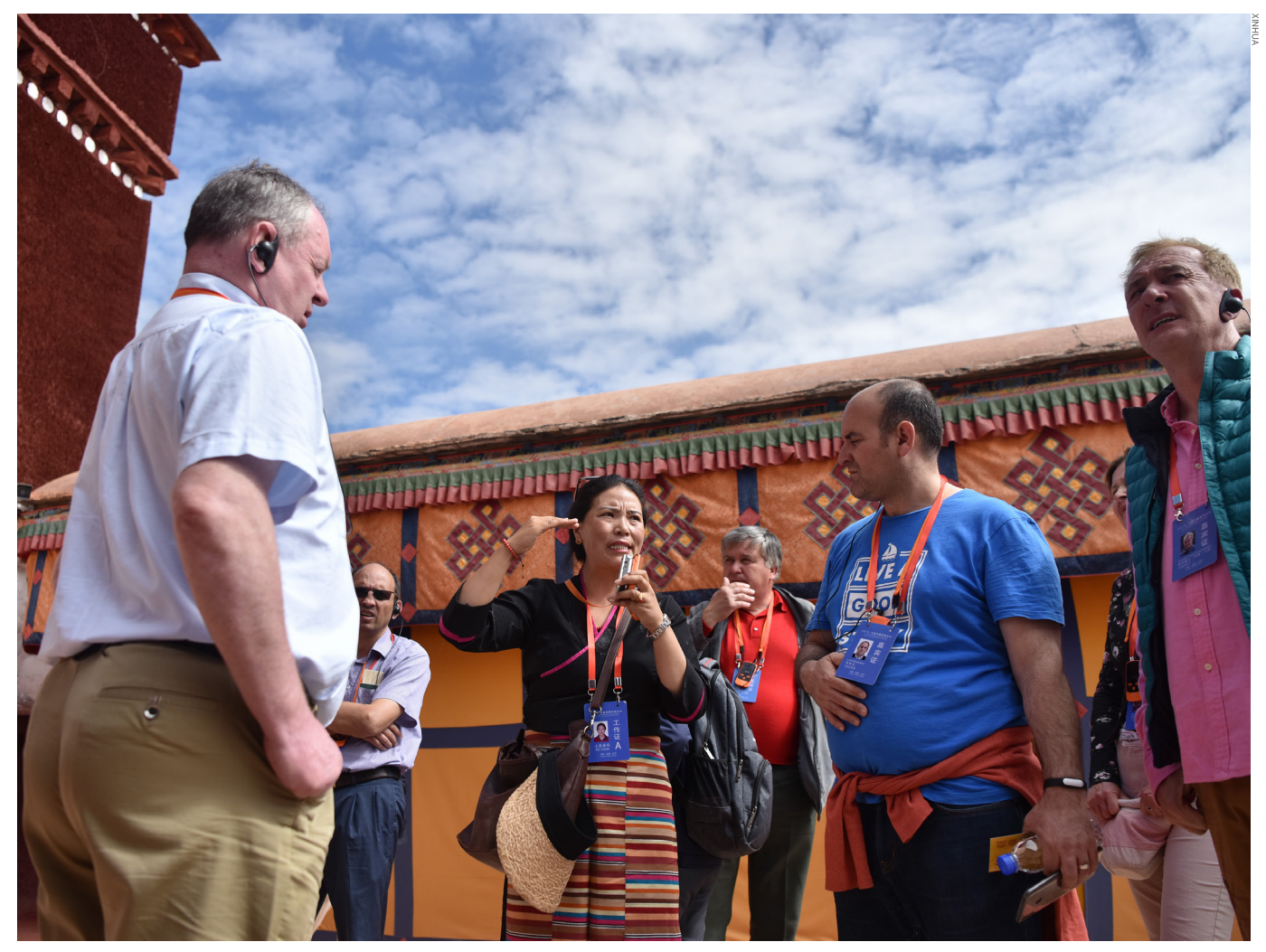
A guide shows visitors around the Potala Palace in Lhasa, capital city of southwest China's Tibet Autonomous Region, on June 13

while South Asia sent local specialties and Buddhism, enriching each other and creating deep trade and cultural ties.