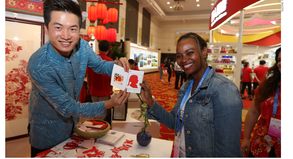
A delegate takes photo with a local artist in the Lankao Exhibition Center in Henan Province on June 28

Traditional culture and handicrafts are being preserved and carried forward along with progress in agriculture and the economy, which is a model provided by China in exploring how to balance the development of urban and rural areas as well as attracting more migrant workers to find new jobs and seize opportuni-