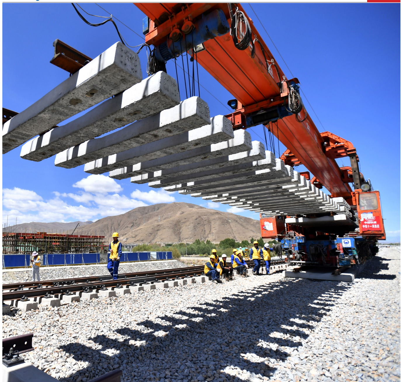
Builders work on the Sichuan-Tibet Railway in Zhanang County, southwest China's Tibet Autonomous Region, on June 6