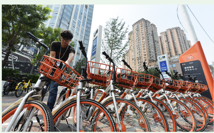
An operation and maintenance worker arranges shared bikes on a sidewalk in Tianjin on August 21 (XINHUA)

The statement also said prudent monetary policy should be kept neutral, the floodgates of monetary supply should be controlled and credit and social financing should see reasonable growth.