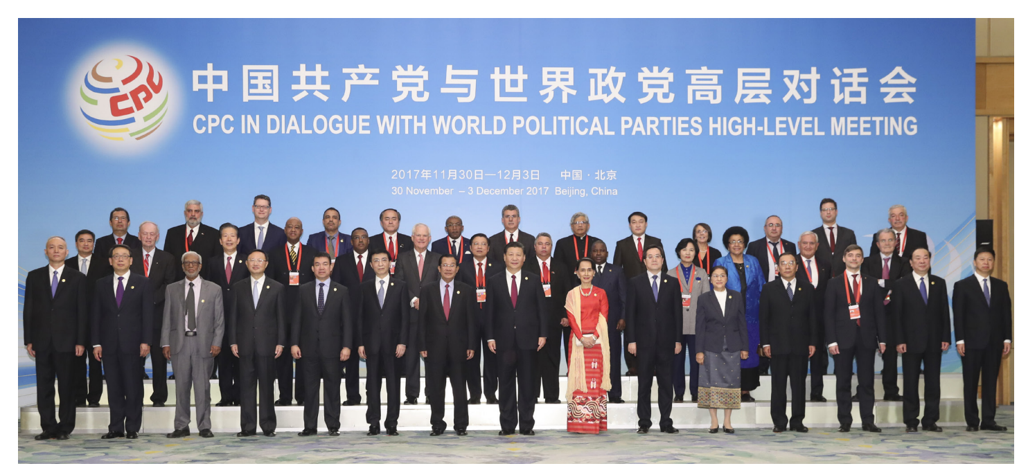
Political party leaders pose for a group photo at the CPC in Dialogue With World Political Parties High-Level Meeting in Beijing on December 1 (XINHUA)

The task of governing the world's most populous nation is anything but simple. The challenges China has faced during its transition toward economic development can serve as a reference for ruling parties elsewhere, especially amongst developing countries themselves. China's success comes at a time when many countries are looking for new paradigms on which to base their development. and as power gradually shifts away from traditional strongholds in the West.