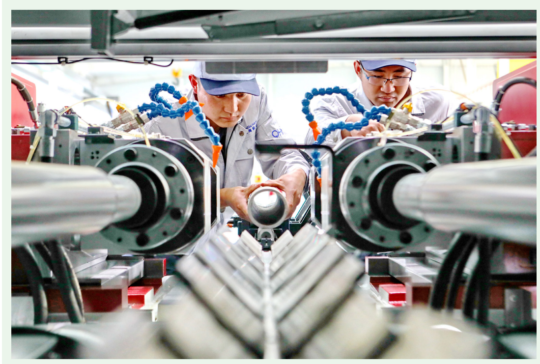
Technicians work in the plant of a nuclear power equipment manufacturing company in Xuanhua, north China's Hebei Province on May 2

wo months after the conclusion of the Communist Party of China's twice-a-decade national congress in October 2017, the country has again come under the global spotlight by convening its most important annual economic meeting, which from December 18 to 20 announced that the world's second largest economy is entering a new phase of development, its focus moving from high-speed growth to highquality development.