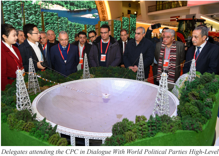
Meeting in Beijing visit School of CPC Central Committee on December 1 2017

Therefore, the CPC will, as always, contribute to world peace. He also pledged that China will never seek hegemony or engage in expansionism, no matter what stage of development it reaches, but it will keep on working for common development and contributing to exchanges and mutual learning between different peoples.