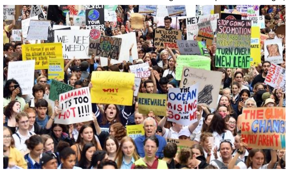
Popular protest led by young people around the world demands radical action on climate change

Prime Minister Morrison will travel to Glasgow immediately after the G20 meeting in Rome. The Australian government has a well-earned reputation as an apologist for the fossil fuel monopolies, led by a shallow individual whose promises and commitments mean little. In a government flush with climate change deniers and protectors of the coal and gas giants, Morrison waffles on about "modern farming technologies" and "avoided land clearing" and funding "carbon capture and storage", but has