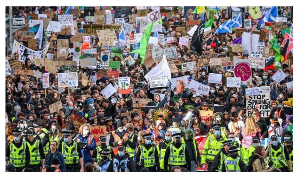
Inaction on climate change by capitalist governments at COP26 was met with determined protests by the people

Leader's speeches revealed totally inadequate commitments by the major industrialised countries to reduce greenhouse gas emissions — the total of the promises and commitments made