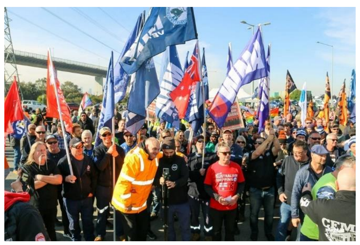
Workers mobilise in support of the Maritime Union in Melbourne in July 2021

relentless attacks on the rights, wages and conditions of the entire working class. Corporate attacks can only be fought by the collective power of the working class with its own independent and fighting demands - an independent working class agenda not beholden to or reliant on politicians, parliamentary parties and the courts.