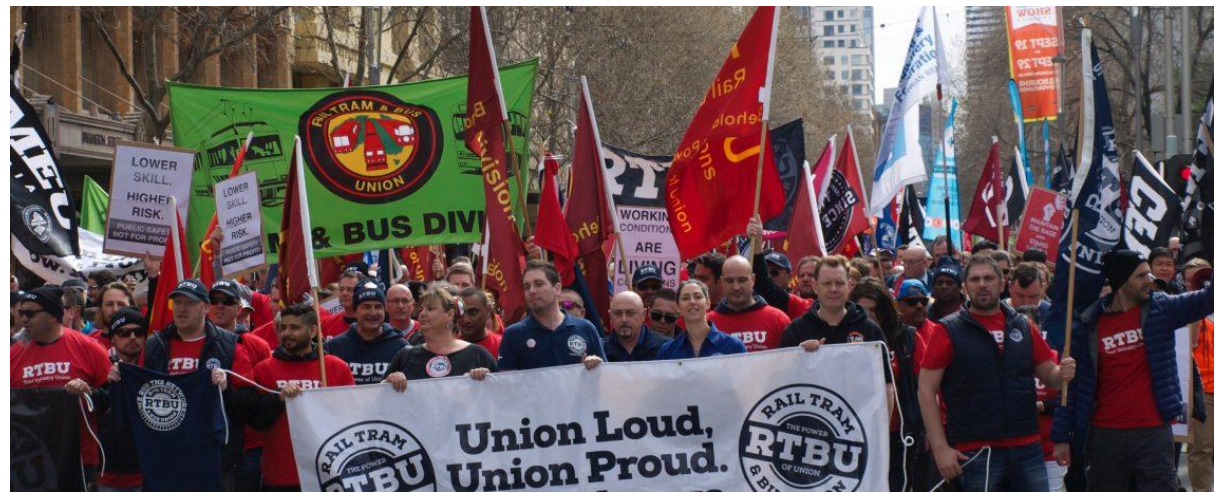
Members of the Rail, Tram and Bus Union (RTBU) rally to defend their rights and conditions in Victoria

We stand by these statements, and work towards the day when all transport in Australia will be run by the Government of an Independent Australia for the benefit of all the Australian people.