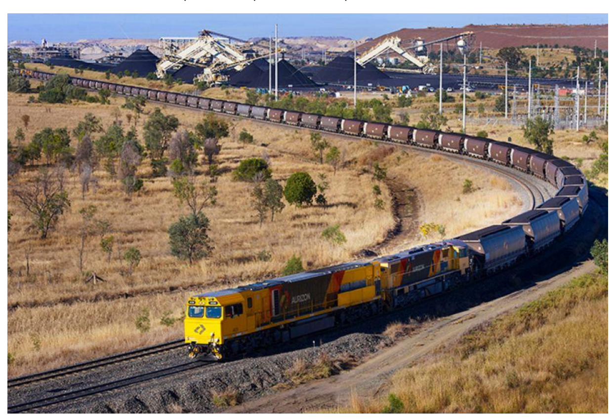
Railways and the transportation industry occupy a unique position in the process of production and circulation

Railways are an independent branch of production, thus a separate sphere of investment for productive capital and are also a continuation of a process of production within the process of circulation and for the process of circulation. Improvements in transport allow the capitalists to turn their capital over much quicker by getting their products to market in a shorter time. Think of the improvements in travel time brought about by steamships and railways compared to travel times by sailing ships and horse-drawn transport.