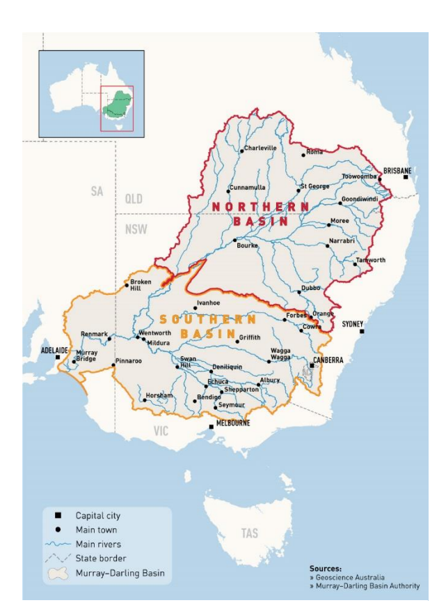
A map of the massive Murray-Darling Basin, vital to a large part of Australian agriculture

The COVID crisis in Australia revealed a weakness that many areas of Australian agriculture require the use of overseas workers for casual work in planting and harvesting fruit and vegetable crops, shearing and operating harvest machinery.