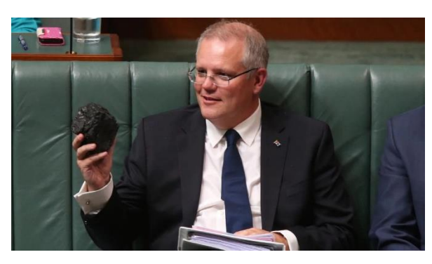
Prime Minister Morrison brandishes a chunk of coal in parliament, showing whose interests he serves

The Morrison government will continue to underwrite the coal industry in Australia using every trick to frustrate and delay the final years. Federal Energy Minister Angus Taylor has been sprouting a "capacity mechanism" which would provide rapid energy generation when "the sun isn't shining and the wind blowing" using pumped hydro, gas, batteries and coal-fired power stations. The implication is that renewables are not reliable and that coal needs to stay in the mix. In return, Morrison and Co. hope to be re-elected on the back of coal miners' votes in Queensland and New South Wales.