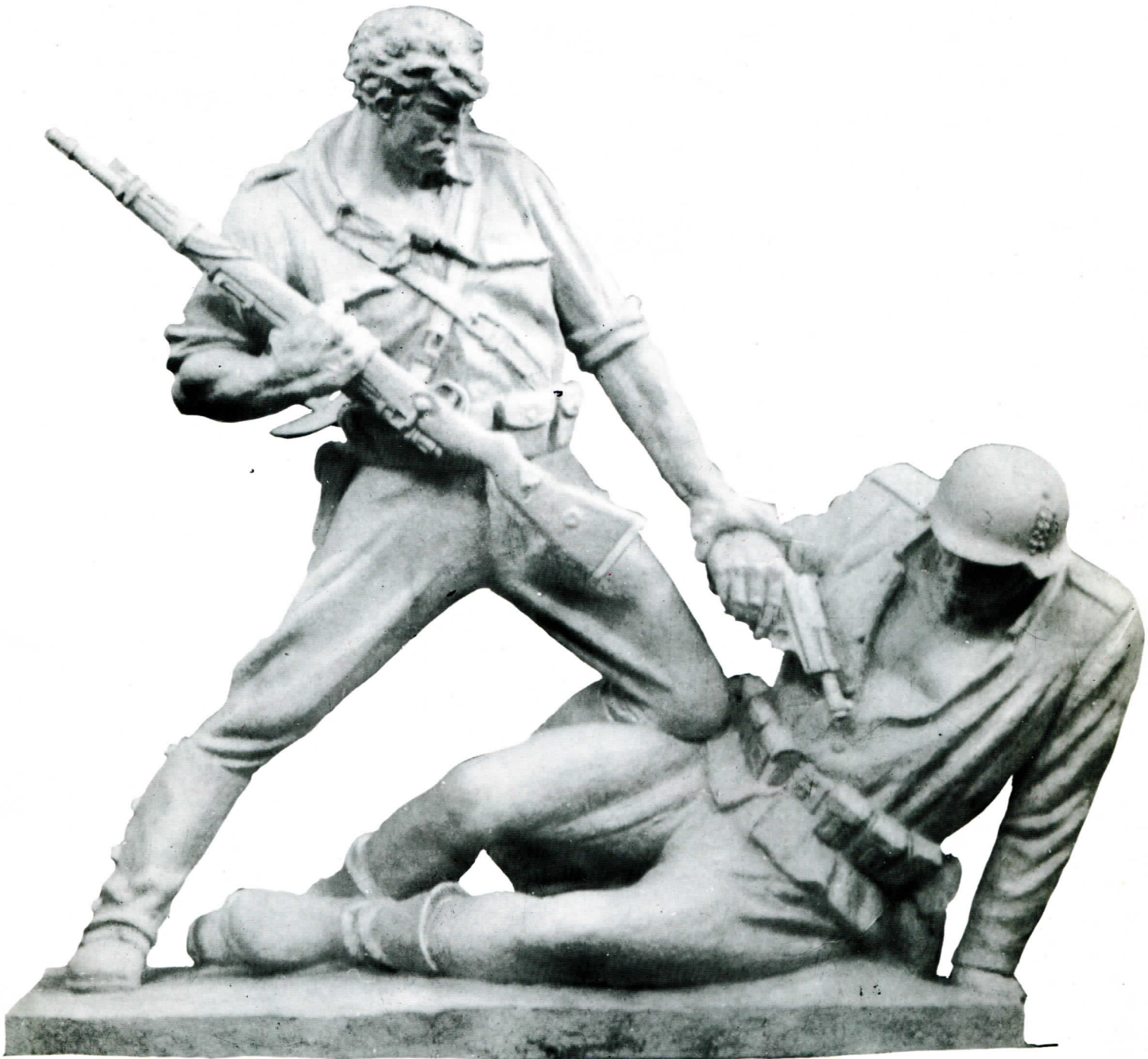
The victory over fascism (sculpture by Odhise Paskali)