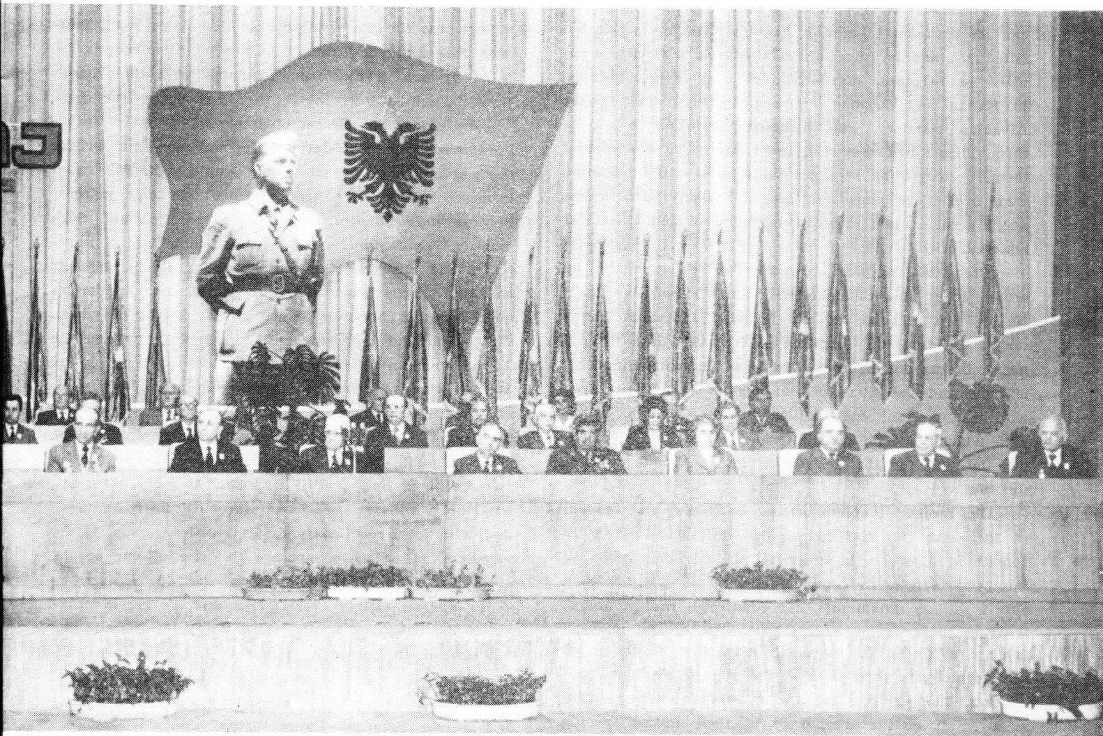
The presidium of the solemn meeting held on the occasion of the 40th anniversary of the victory over fascism

and the strategist of this war, Comrade Enver Hoxha, is the most fierce, the bloodiest and most glorious war in the history of centuries-long struggles our people have waged for freedom, independence and social progress. In this war, which went beyond the limits of a war for national liberation, the most profound and radical turn in the historic destiny of our people was made: the Communist Party was created and the people's revolution triumphed. With the glorious victory which was achieved on November 29, 1944, the ardent desires and the boldest dreams of the Albanian patriots of the past and of the whole people were realized.