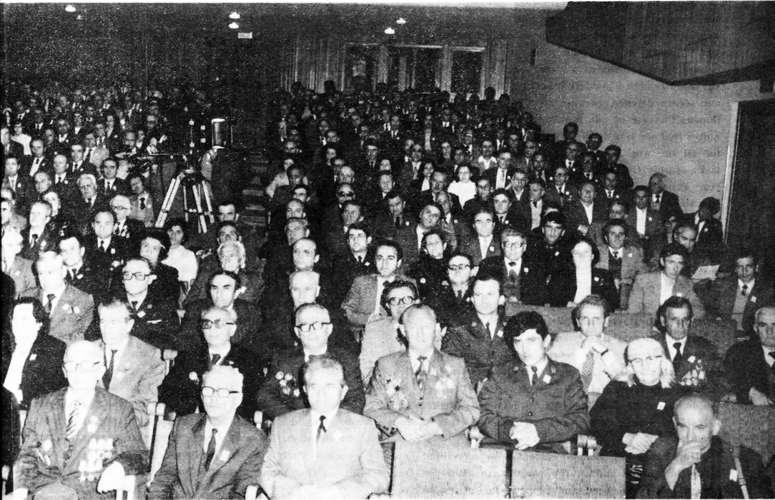
View of the hall during the commemorative meeting.

of free medical assistance for all. From a semi-colony of European imperialism, Albania today is a country with an independent economy and policy. It accepts no dictate and tutelage from anyone and has its say boldly in the world.