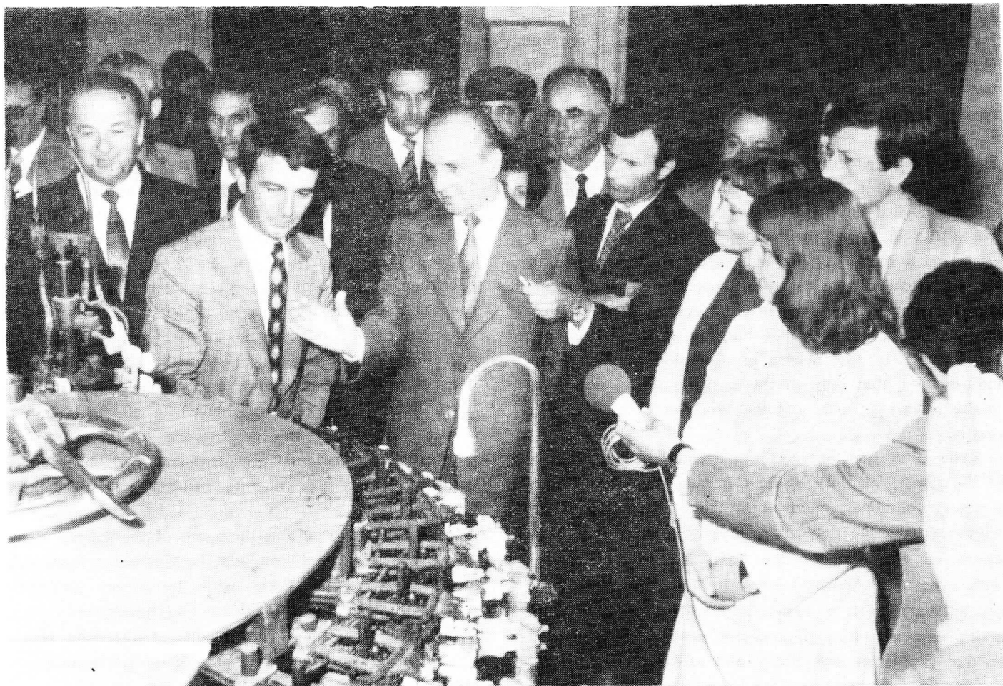
Comrade RAMIZ ALIA visiting the electric bulbs factory.

enthusiastic applause and ovations for the Party when Comrade Ramiz Alia came in. He met and had cordial talks with cadres of different sectors.