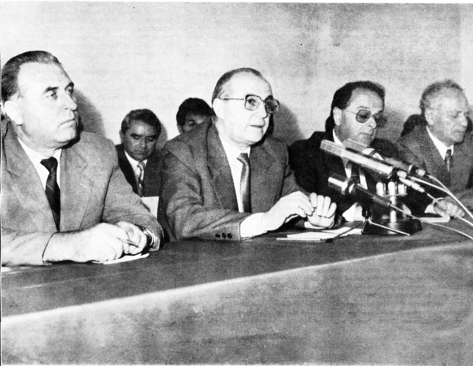
Comrade RAMIZ ALIA speaking at a meeting with the cadres of the district of Vlora.