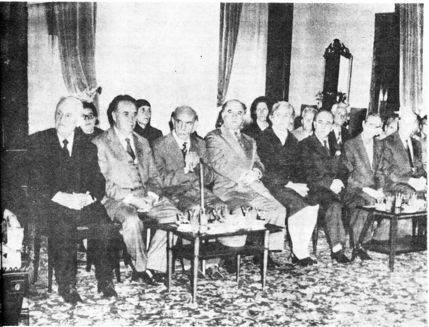
Members of martyrs' families and veterans of the Anti-fascist National Liberation War

that dark clouds of aggressive wars have gathered on the horizons of the world. Many phenomena and events are reminders of the period which led to the outbreak of the two previous world wars. New pretenders to the establishment of world domination have emerged. The imperialist and social-imperialist superpowers, the United States of America and the Soviet Union, with their openly hegemonic and aggressive policies which they pursue, seriously threaten the world with the outbreak of a general conflict. Irrestrainable imperialist rivalry, the frantic arms race and war preparations pose great threats to the freedom and independence of all countries, peace and international security. There is no country in the world today which, in different degrees and manners, is not threatened by the aggressive course of imperialism and social-imperialism.